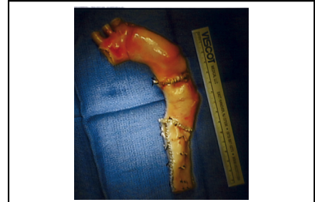
Aortic arch–descending thoracic aorta composite graft with 3 segments made from 4 homografts.

In the operating room, the right subclavian artery (SCA) and right femoral artery were exposed, 8-mm grafts were sewn end-to-side for arterial inflow during cardiopulmonary bypass, and a median sternotomy was performed. The anatomy superior to the heart was unrecognizable from the intense inflammation around the aortic pseudoaneurysm. Bypass was initiated with cooling to 15°C, and the heart was arrested and herniated into the right side of the chest through an opening in the right pericardium. Through this opening and a small left anterior thoracotomy, the DTA