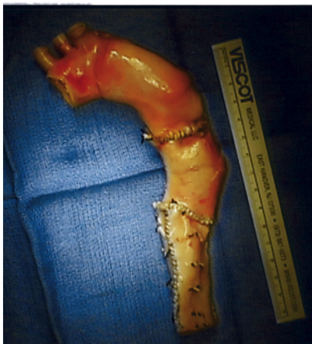
FIGURE 2. Aortic arch and descending thoracic aorta composite graft with 3 segments made from 4 homografts.

the proximal homograft allowed the composite graft to mimic the natural shape of the arch. Cutting smaller DTA homograft pieces longitudinally and then sewing them together to form a single element worked well to achieve needed length. Although technically challenging, composite homograft repairs offer a viable solution to these frequently mortal complications.