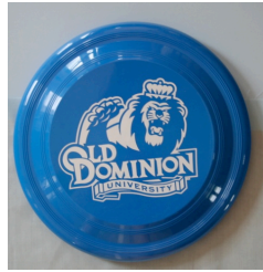
Frisbee (1 per box)