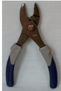
Slip Joint Pliers (1 per box)