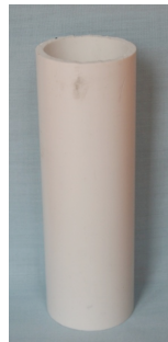
1 1/2" PVC Pipes (8 per box)