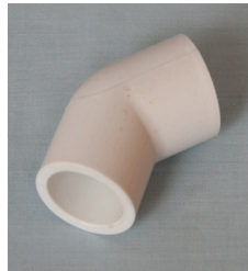
45° Connectors (4 per box)