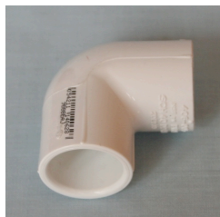
1/2" 90° Elbows (8 per box)