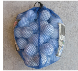
Golf Balls (Approximately 300) *We like to use mesh bags of used golf balls*