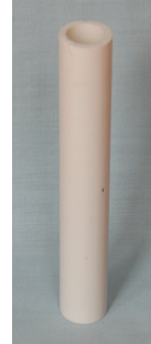
1/2" PVC Pipes (12 per box)