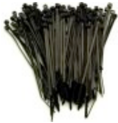
Zip Ties (50 per box)