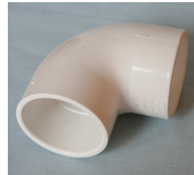
1 1/2" 90° Elbows (8 per box)