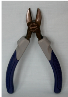
Diagonal Pliers (1 per box)