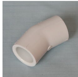
22° Connectors (4 per box)