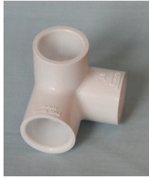
3-way Connectors (8 per box)