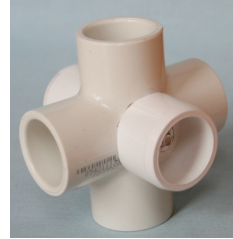
6-way Connector (1 per box)