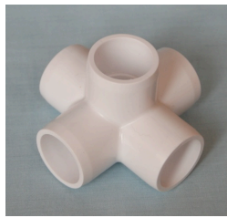
5-way Connectors (2 per box)