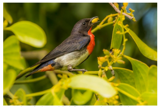
A male mistletoe bird feeds on box mistletoe

Mistletoe is often associated with Christmas, yet native mistletoe is something of an unsung hero when it comes to woodland birds. It provides food, shelter, and nest sites, including for the critically endangered regent honeyeater, but repeated bushfires in recent years have wiped it out from a key breeding area in New South Wales' Lower Hunter region. Mistletoe does not regenerate after bushfires and, without intervention, it will take many years to reestablish in the Tomalpin Woodlands — time the regent honeyeater does not have, as there are only about 300 left in the wild.