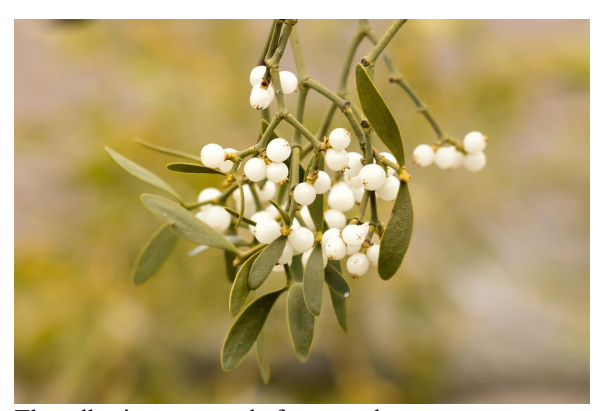
The adhesive was made from a substance surrounding the seeds in mistletoe berries, known as viscin.

In order to spread to other host trees, the parasitic mistletoe plant has very sticky seeds that cling to bird feathers, bark, and other materials. According to a recent study, the 'glue' on those seeds could inspire new biomedical adhesives.